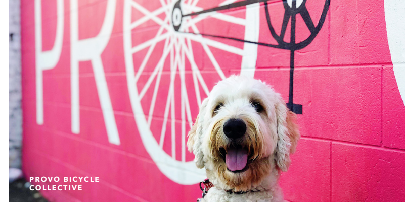
PROVO BICYCLE COLLECTIVE